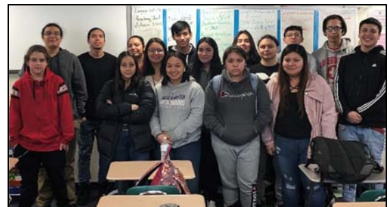
March 13, 2019 Oneida Nation High School Clan Council collaborated with the LOC on a potential Curfew Law.

The LOC is taking this opportunity to collaborate with the Oneida Nation High School (ONHS) students. On March 13, 2019 staff from the