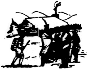
Oneidas bringing several hundred bags of corn to Washington's starving army at Valley Forge, after the colonists had consistently