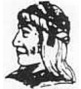
UGWA DEMOLUM YATEHE Because of the help of this Oneida Chief in cementing a friendship between the six nations and the Colony of Pennsylvania, a new nation, the United States, was made possible