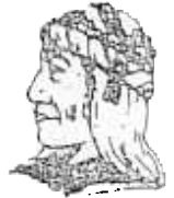
UGRA DEMOLON TATEHE Because of the help of this Oneida Chief in cementing a friendship between the six nations and the Colony of Pennsylvania, a new nation, the United States was made possible.