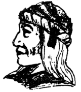
UGWA BEHOLUH YATEHE Because of the help of this Oneida Chief in cementing a friendship between the six nations and the Colony of Pennsylvania, a new nation, the United States was made possible.