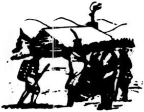
Oneidas bringing several hundred bags of corn to Washington's starving army at Valley Forge after the colonists had consistently refused to aid them