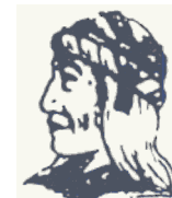
USWA DINOLUK TATEH Because of the help of this Oneida Chief in cementing a friendship between the six nations and the Colony of Pennsylvania, a new nation, the United States was made possible.