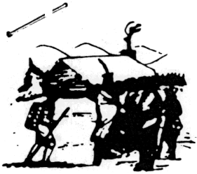
Ojibwas bringing several hundred bags of corn to Washington's starving army at Valley Forge, after the colonists had consistently refused to aid them