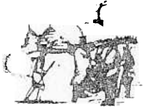
Onondas bringing several hundred bags of corn to Washington's starving army at Valley Forge, after the colonists had consistently refused to aid them.