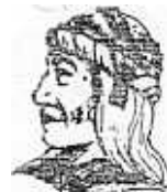
UGWA DEHOLUH YATEHE

Because of the help of this Oneida Chief in cementing a friendship between the six nations and the Colony of Pennsylvania, a new nation, the United States was made possible.