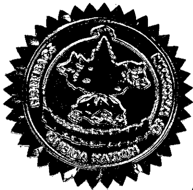
Seal of the Sovereign Oneida Nation

Signed this 24th day of September , 19 97 by