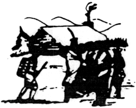
Ojibwas bringing several hundred bags of corn to Washington's starving army at Valley Forge, after the colonists had consistently refused to aid them