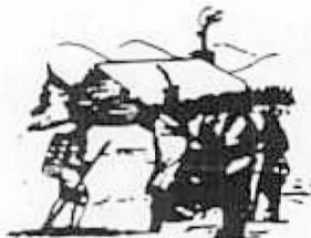
Oneidas bringing several hundred bags of corn to Washington's starving army at Valley Forge. After the colonists had consistently refused to aid them