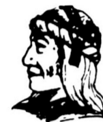
UGWA DEMOLUM YATEHE Because of the help of this Oneida Chief in cementing a friendship between the six nations and the Colony of Pennsylvania, a new nation the United States was made possible