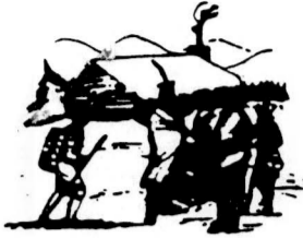
Oneidas bringing several hundred bags of corn to Washington's starving army at Valley Forge after the colonists had consistently refused to aid them.