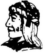
UGWA DEMOLUM YATEME Because of the help of this Oneida Chief in cementing a friendship between the six nations and the Colony of Pennsylvania, a new nation the United States was made possible