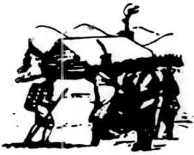
Oneidas bringing several hundred bags of corn to Washington's starving army at Valley Forge, after the colonists had consistently refused to aid them.