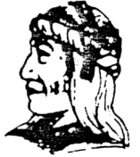
UGWA DEMOLUM YATEHE Because of the help of this Oneida Chief in cementing a friendship between the six nations and the Colony of Pennsylvania a new nation the United States was made possible