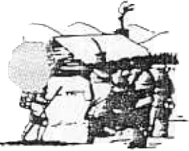
Onedias bringing several hundred bags of corn to Washington's starving army at Valley Forge, after the colonists had consistently