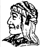
UGWA DEHOLUH YATEHE Because of the help of this Oneida Chief in cementing a friendship between the six nations and the Colony of Pennsylvania, a new nation, the United States was made possible.