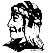
UGWA DEMOLUN YATENE Because of the help of this Oneida Chief in cementing a friendship between the six nations and the Colony of Pennsylvania, a new nation, the United States was made possible.