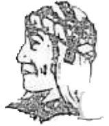
UGWA DEMOLUH TATENE Because of the help of this Oneida Chief in cementing a friendship between the six nations and the Colony of Pennsylvania, a new nation, the United States was made possible.