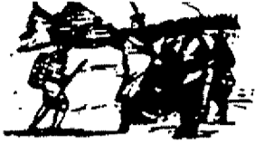
Oneidas bringing several bags of corn to the starving army at Valley Forge, after the colonists had consistently refused to aid them.