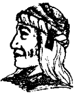
UGWA DEHOLUH YATEH

Oneidas bringing several hundred bags of corn to Washington's starving army at Valley Forge, after the colonists had consistently refused to aid them.