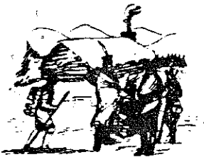
Onondagas bringing several hundred bags of corn to Washington's starving army at Valley Forge, after the colonists had consistently refused to aid them.