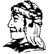
UGWA DEMOLUM YATEHE Because of the heroism of this Oneida Chief in cementing a friendship between the six nations and the Colony of Pennsylvania, a new nation the United States was made possible