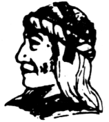
UGWA DEMOLUM YATEHE Because of the help of this Oneida Chief in cementing a friendship between the six nations and the Colony of Pennsylvania, a new nation, the United States, was made possible