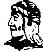
UGWA DEMOLUM KATEHE Because of the help of this Oneida Chief in cementing a friendship between the Six Nations and the Colony of Pennsylvania a new nation, the United States, was made possible.