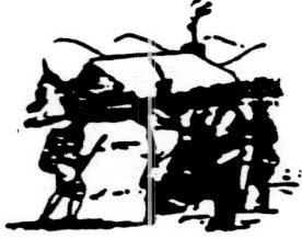
Oneidas bringing several hundred bags of corn to Washington's starving army at Valley Forge after the colonists had consistently refused to aid them.