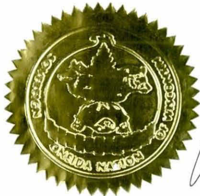
Seal of the Sovereign Oneida Nation

Signed this 10 th day of July , 19 96 by