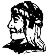
UGWA DEMOLUM YATEHE Because of the help of this Oneida Chief in cementing a friendship between the six nations and the Colony of Pennsylvania, a new nation, the United States, was