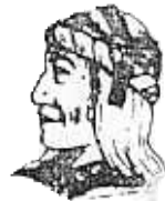
UGWA GENDLUM Because of the help of this Oneida Chief in cementing a friendship between the six nations and the Colony of Pennsylvania, a new nation, the United States was made possible.