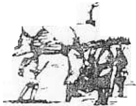
Oneidas bringing several hundred bags of corn to Washington's starving army at Valley Forge, after the colonists had consistently refused to aid them.