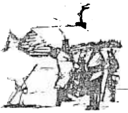
Onaidas bringing several hundred bags of corn to Washington's starving army at Valley Forge, after the colonists had consistently refused to aid them.