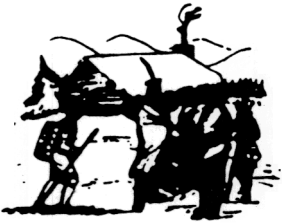
Oneidas bringing several hundred bags of corn to Washington's starving army at Valley Forge, after the colonists had consistently