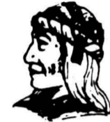
UGWA DEMOLUM YATEHE Because of the help of this Oneida Chief in cementing a friendship between the six nations and the Colony of Pennsylvania, a new nation, the United States, was