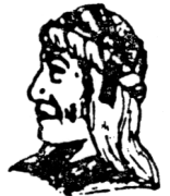
UGWA GENOLUH YATENE Because of the help of this Oneida Chief in cementing a friendship between the six nations and the Colony of Pennsylvania, a new nation, the United States was made possible.