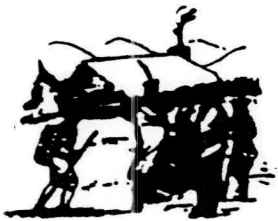
Oneidas bringing several hundred bags of corn to Washington's starving army at Valley Forge after the colonists had consistently refused to aid them