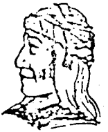
UGWA DEMOLUN YATENE

Because of the hel of this Oneida Chief in cementing a friend ship between the si nations and the Colon of Pennsylvania, a new nation, the United States was made pos sible.