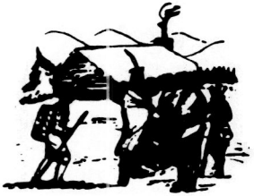
Oneidas bringing several hundred bags of corn to Washington's starving army at Valley Forge, after the colonists had consistently refused to aid them.