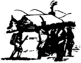
Oneidas bringing several hundred bags of corn to Washington's starving army at Valley Forge, after the colonists had consistently refused to aid them.