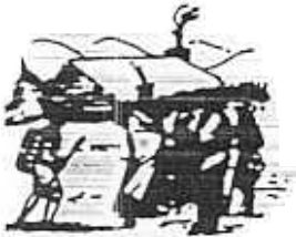
Oneidas bringing several hundred bags of corn to Washington's starving army at Valley Forge. after the colonists had consistently refused to aid them