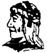
UGWA DEMOLUM YATEHE Because of the help of this Oneida Chief in cementing a friendship between the six nations and the Colony of Pennsylvania a new nation, the United States was made possible