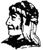
UGWA DEMOLUM YATEHE Because of the help of this Oneida Chief in cementing a friendship between the six nations and the Colony of Pennsylvania, a new nation, the United States, was