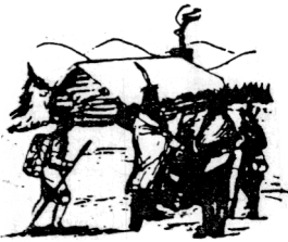
Oneidas bringing several hundred bags of corn to Washington's starving army at Valley Forge, after the colonists had consistently refused to aid