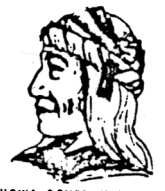
UGWA DEMOLUN YATEHE Because of the help of this Oneida Chief in cementing a friendship between the six nations and the Colony of Pennsylvania, a new nation, the United States was made possible.