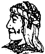
USHA GENOLUN TATEHE