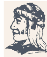
UGWADDEMOLUMYATEHE Because of the help of this Oneida Chief in cementing a friendship between the six nations and the Colony of Pennsylvania, a new nation the United States was made possible