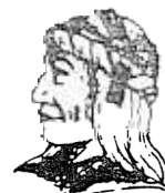
UGWA DENOLUH YATEHE Because of the help of this Oneida Chief in cementing a friendship between the six nations and the Colony of Pennsylvania, a new nation, the United States was made possible.