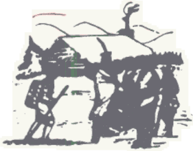
Oneidas bringing several hundrec bags of corn to Washington's starving army at Valley Forge, after the colonists had consistently refused to aid them.