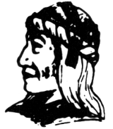
UGWA DEMOLUM YATEHE Because of the help of this Oneida Chief in cementing a friendship between the six nations and the Colony of Pennsylvania, a new nation, the United States, was