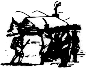
Oneidas bringing several hundred bags of corn to Washington's starving army at Valley Forge. after the colonists had consistently refused to aid them