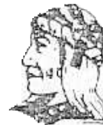
UGWA DENOLUN YATEHE Because of the help of this Oneida Chief in cementing a friendship between the six nations and the Colony of Pennsylvania, a new nation, the United States was made possible.