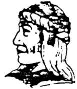
UGWA DEMOLUM YATEHE Because of the help of this Oneida Chief in cementing ... six nations and the Colony of Pennsylvania a new nation the United States was made possible