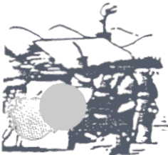
Oneidas bringing several hundred bags of corn to Washington's starving army at Valley Forge. After the colonists had consistently