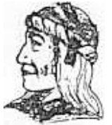
UGWA DEMOLUH YATENE Because of the help of this Oneida Chief in cementing a friendship between the six nations and the Colony of Pennsylvania, a new nation, the United States was made possible.