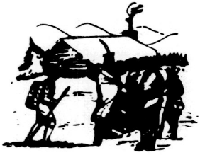
Oneidas bringing several hundred bags of corn to Washington's starving army at Valley Forge. after the colonists had consistently refused to aid them.